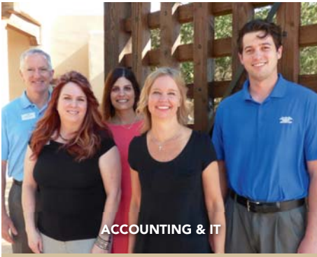
ACCOUNTING & IT